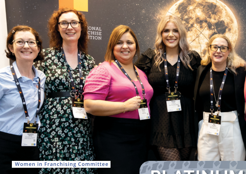
Women in Franchising Committee