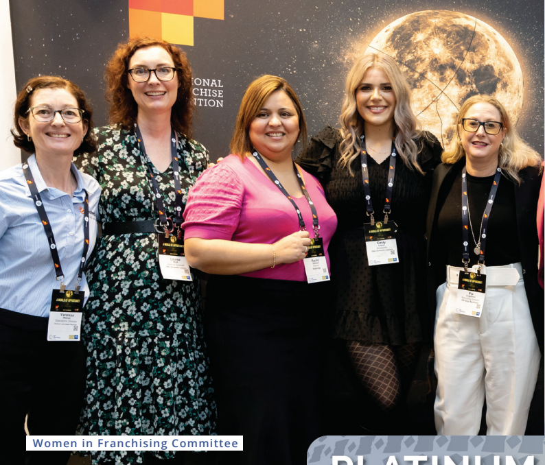
Women in Franchising Committee